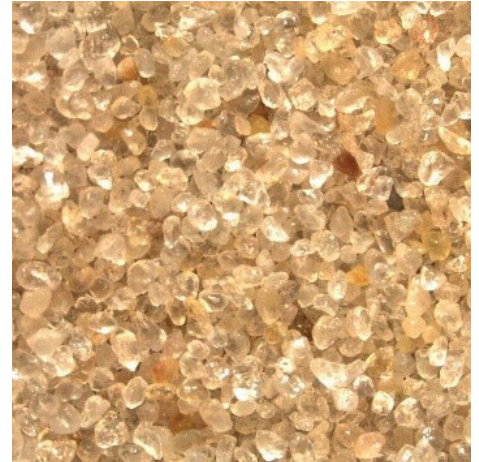
100-mesh standard frac sand suits technical and economic requirements for wells with normal closure stress.

All sources for this proppant are carefully selected for quality with properties that ensure the proppant's ability to withstand typical downhole environments without degradation and maintain a conductive pathway after fracture closure.