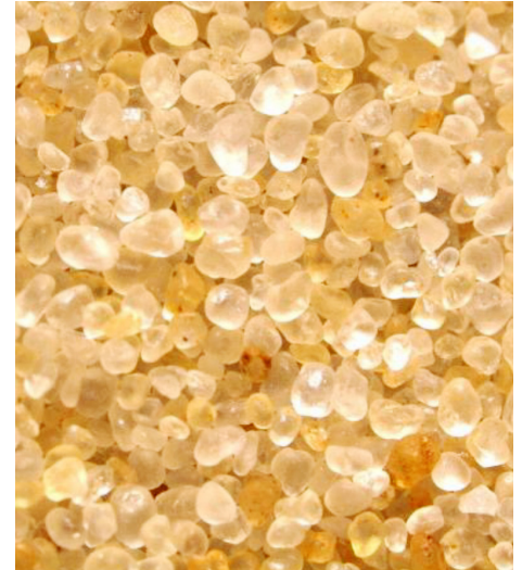
40/70-mesh premium frac sand has high silica content with roundness and sphericity values typically greater than or equal to 0.7.

40/70-mesh premium frac sand is selected with the highest quality standards. Sourced from Midwest mines in Wonewoc formations, 40/70-mesh premium frac sand exceeds industry expectations for high-quality Northern White sand. The high resistance to crush and very low acid solubility enable 40/70-mesh premium frac sand to withstand harsh downhole conditions and maintain strength and integrity after fracture closure.